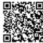
Liner Set-up Guide

For welding with Aluminum wires use a Combi-liner (page 22). Optimum installation is achieved when using the Combi-liner set-up kit.